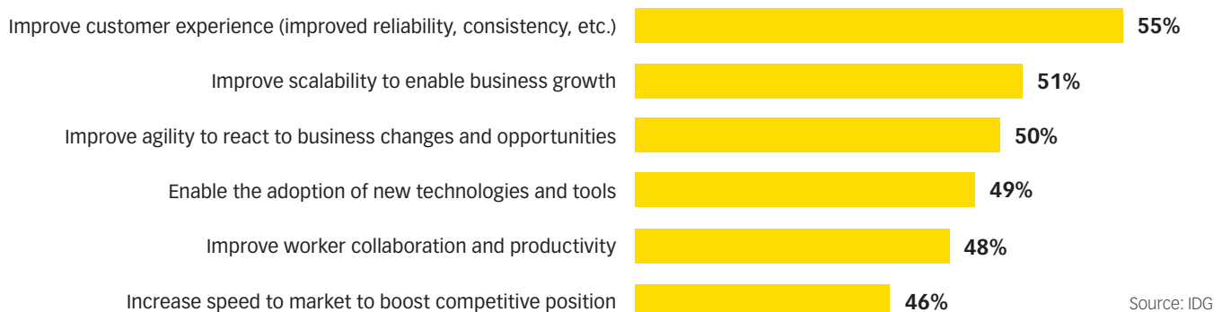
FIGURE 3. How Companies Leverage Public Cloud to Support Digital Transformation

There's evidence that companies further along in their transformational journeys are more likely to adopt a cloud-first strategy, with plans to shift the majority of their workloads to a public cloud: Of those whose digital transformation is enterprise-wide, 49% are shifting primarily to public cloud, versus 24% who say they're deploying a few workloads in public cloud, and 23% who say they're extending to hybrid cloud.